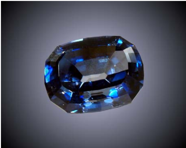
Faceted benitoite (2.90 carats; 5x7x5 mm) Benitoite Gem mine, California

These six specimens were stolen from the Mineral Hall of the Santa Barbara Museum of Natural History in an early morning break-in on December 10, 2011. Anyone with information regarding these specimens should contact Officer Gary Gaston ( ggaston@sbpd.com ) of the Santa Barbara Police Department. The case number is 11-85616.