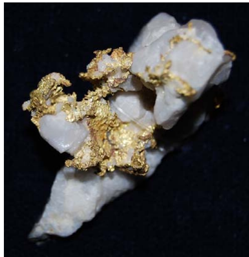
Crystallized gold on quartz (no size given) California