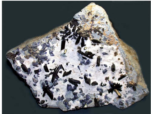
Benitoite and neptunite (8 x 12.5 in.) Benitoite Gem mine, California