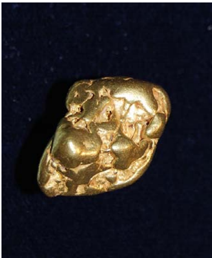
Gold nugget (1.27 oz. troy) American River, California