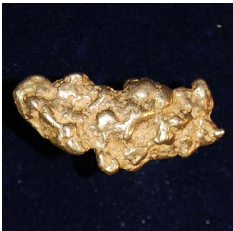
Gold nugget (2.93 oz. troy) American River, California